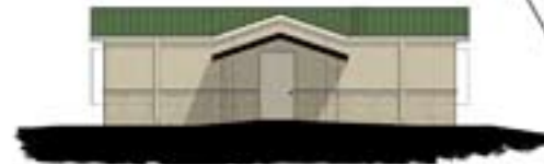
WEST ELEVATION - DAF CONTROL BUILDING

THIS DOCUMENT IS PREPARED FOR THE PURPOSE OF PROVIDING GENERAL INFORMATION ONLY. IT IS NOT TO BE USED FOR CONTRACTS, SPECIFICATIONS, OR OTHER LEGAL DOCUMENTS. THE USER ASSUMES ALL LIABILITY FOR ANY AND ALL DAMAGES, INCLUDING REASONABLE ATTORNEY'S FEES, ARISING FROM THE USE OF THIS DOCUMENT.