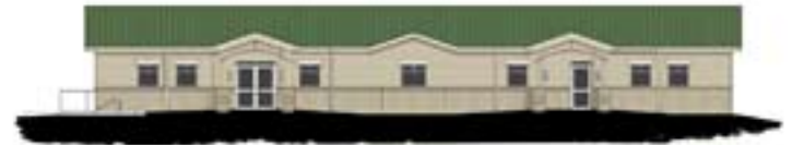
WEST ELEVATION - ADMINISTRATION BUILDING